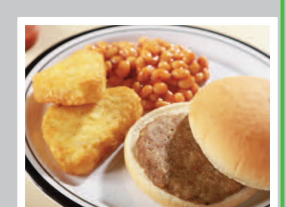
Sausage Pattie in a Bun, Hash Browns and Baked Beans