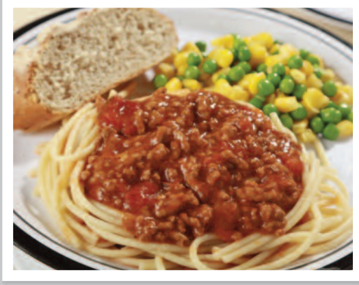
Spaghetti Bolognese served with Garlic & Herb Bread and Seasonal Vegetables