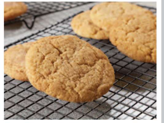
Snicker Doodle Biscuit

AVAILABLE EVERY DAY - UNLIMITED SALAD, FRESHLY BAKED BREAD, FRUIT YOGHURT & FRESH FRUIT PLATTER. FOR ALLERGEN INFORMATION, PLEASE ASK ONE OF OUR CATERING TEAM. ALL THE ABOVE DISHES ARE SUBJECT TO AVAILABILITY.