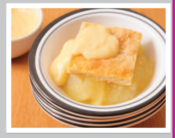
Apple Pie & Custard