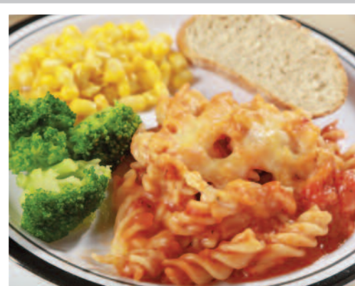
Cheese & Tomato Pasta served with Garlic & Herb Bread and Seasonal Vegetables