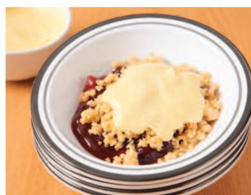
Fruit Crumble & Custard