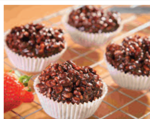
Chocolate Crispy Cake