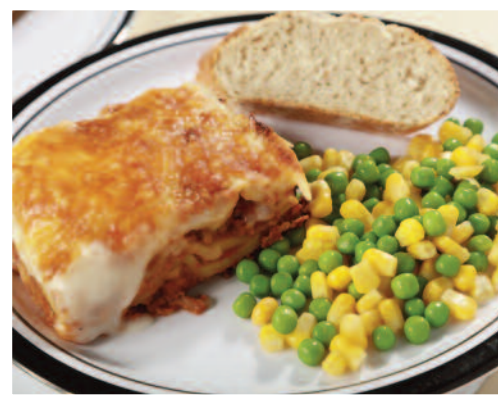
Beef Lasagne served with Garlic & Herb Bread and Seasonal Vegetables