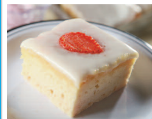
Strawberry Ice Cream Cake