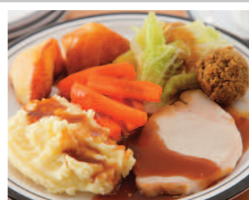
Roast Pork served with Roast/Mashed Potatoes, Seasonal Vegetables & Gravy