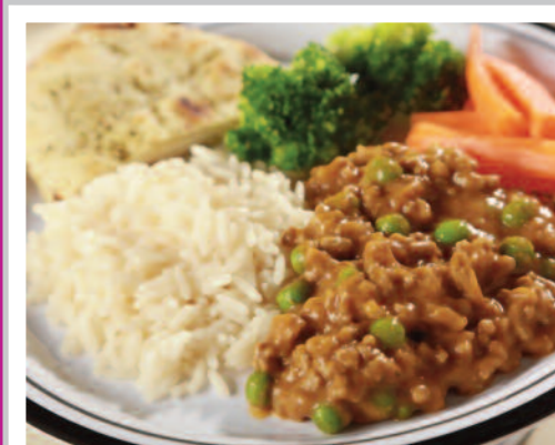
Beef Keema served with Rice, Naan Bread & Seasonal Vegetables