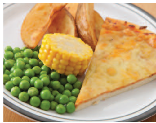
Cheese & Tomato Pizza, served with Potato Wedges & Seasonal Vegetables