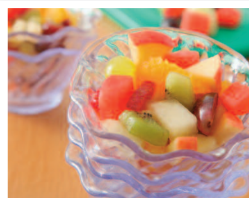
Fresh Fruit Salad