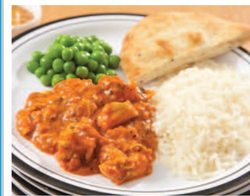
Chicken Tikka Masala served with Rice, Naan Bread & Seasonal Vegetables