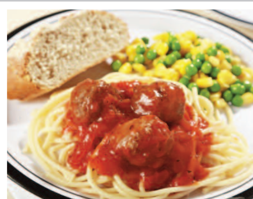
Meatballs in Tomato Sauce served with Spaghetti, Garlic & Herb Bread and Seasonal Vegetables