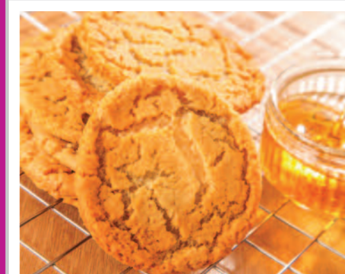
Golden Crunch Cookie

AVAILABLE EVERY DAY – UNLIMITED SALAD, FRESHLY BAKED BREAD, FRUIT YOGHURT & FRESH FRUIT PLATTER. FOR ALLERGEN INFORMATION, PLEASE ASK ONE OF OUR CATERING TEAM. ALL THE ABOVE DISHES ARE SUBJECT TO AVAILABILITY.