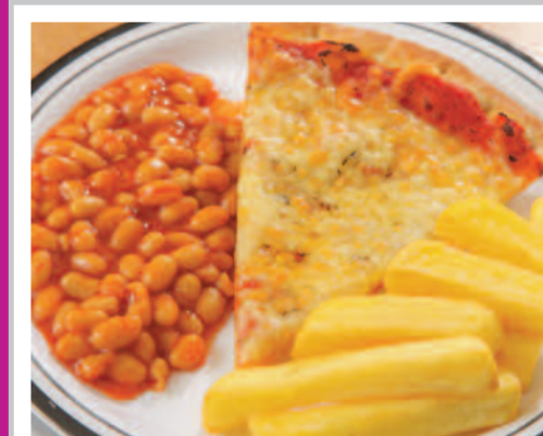
Cheese & Tomato Pizza served with Chips & Peas or Baked Beans