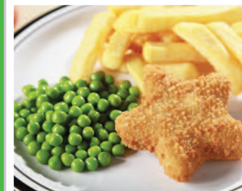
Fish Star (MSC) served with Chips & Peas or Baked Beans