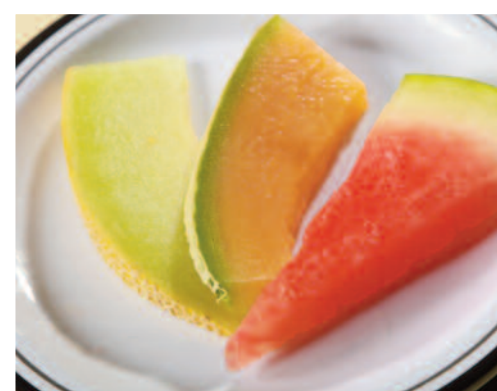
Trio of Melon