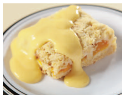
Peach Crumble Slice & Custard